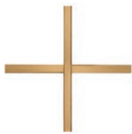
DISTINCT GRILL 1/4" x 5/16" Brass. Paint not available