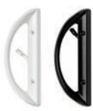
SWS White Patio Black