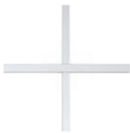
DISTINCT GRILL 1/4" X 5/16" White. Paint not available