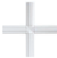
CONTOUR GRILL 8mm x 18mm Paint and Woodgrain not available