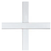
COLONIAL GRILL 1/4" x 5/8" Woodgrain. Paint option available

VWD offers a wide variety of colours and styles to compliment your decor while adding appeal. Choose from white, pewter or a rainbow of colours for your internal grills. Looking for a more classic look? Consider Simulated Divided Lights (SDL) for a unique traditional appearance.