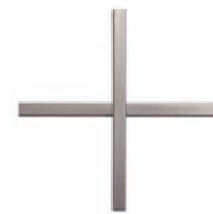
DISTINCT GRILL 1/4" X 5/16" Pewter. Paint not available