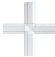
CONTOUR GRILL 8mm x 25mm Paint not available