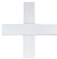
COLONIAL GRILL 1/4"x1" Paint available. Woodgrain not available.