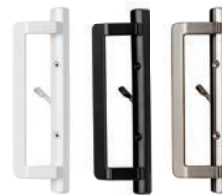
SWS White Patio Black Satin Nickel