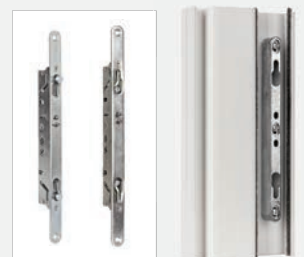
MULTI POINT LOCK (2 POINT) Upgrade