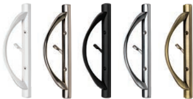
SWS White Satin Nickel Oil Rubbed Bronze Brushed Chrome Antique Brass